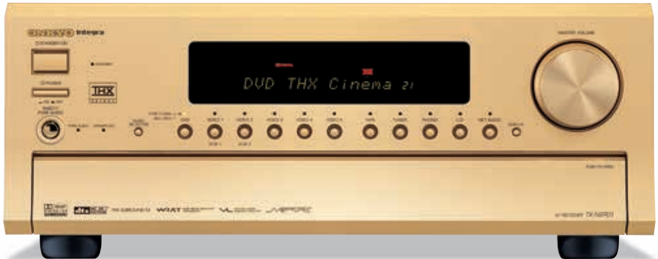
Available in Gold or Black